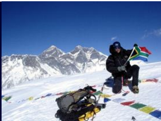
Ama Dablam summit image courtesy of Jagged-Globe (click to enlarge).